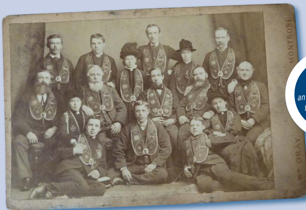
DD1028/33 Photograph of an un-named society from the Buchan area c.1900